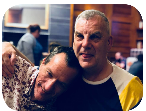
"A very relaxed group of guys. "mEAT UP" would make a great night out for a lot of my friends."