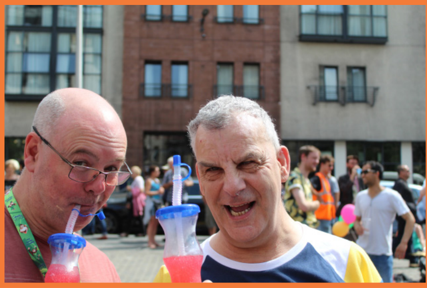
Jazz Festival Mardi Gras Social