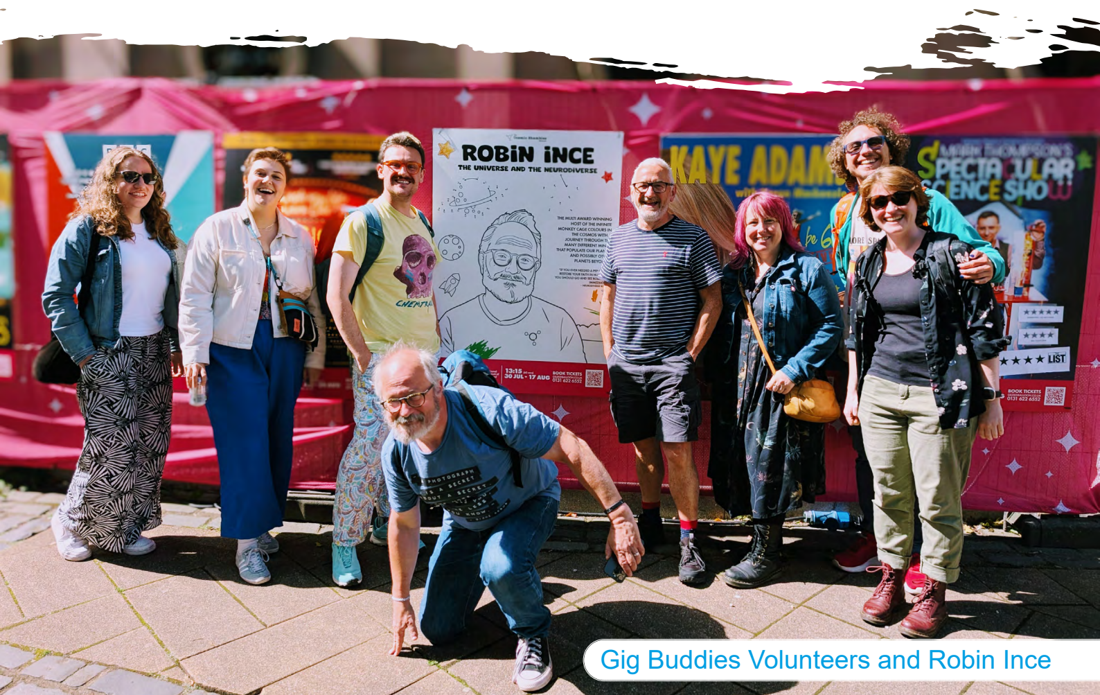
Gig Buddies Volunteers and Robin Ince

This year we gave away over 250 tickets to events at the Edinburgh Festivals, enabling adults with a learning disability and autistic adults to see more shows they love, discover new ones, catch up with friends, and make new ones. Every August the population of Edinburgh doubles, with hundreds of thousands of people flocking to city to take part in and enjoy: The Edinburgh International Festival, The Edinburgh Festival Fringe, The Edinburgh International book Festival, The Edinburgh Children's Festival, The Edinburgh Art Festival, The Edinburgh Film Festival, and The Royal Edinburgh Military Tattoo. Together these make The Edinburgh Festivals the largest performing arts festival on the planet. With such a variety of events on our doorstep, we want to ensure the people we support are confident in access events that interest them, and also have the opportunity to discover others.