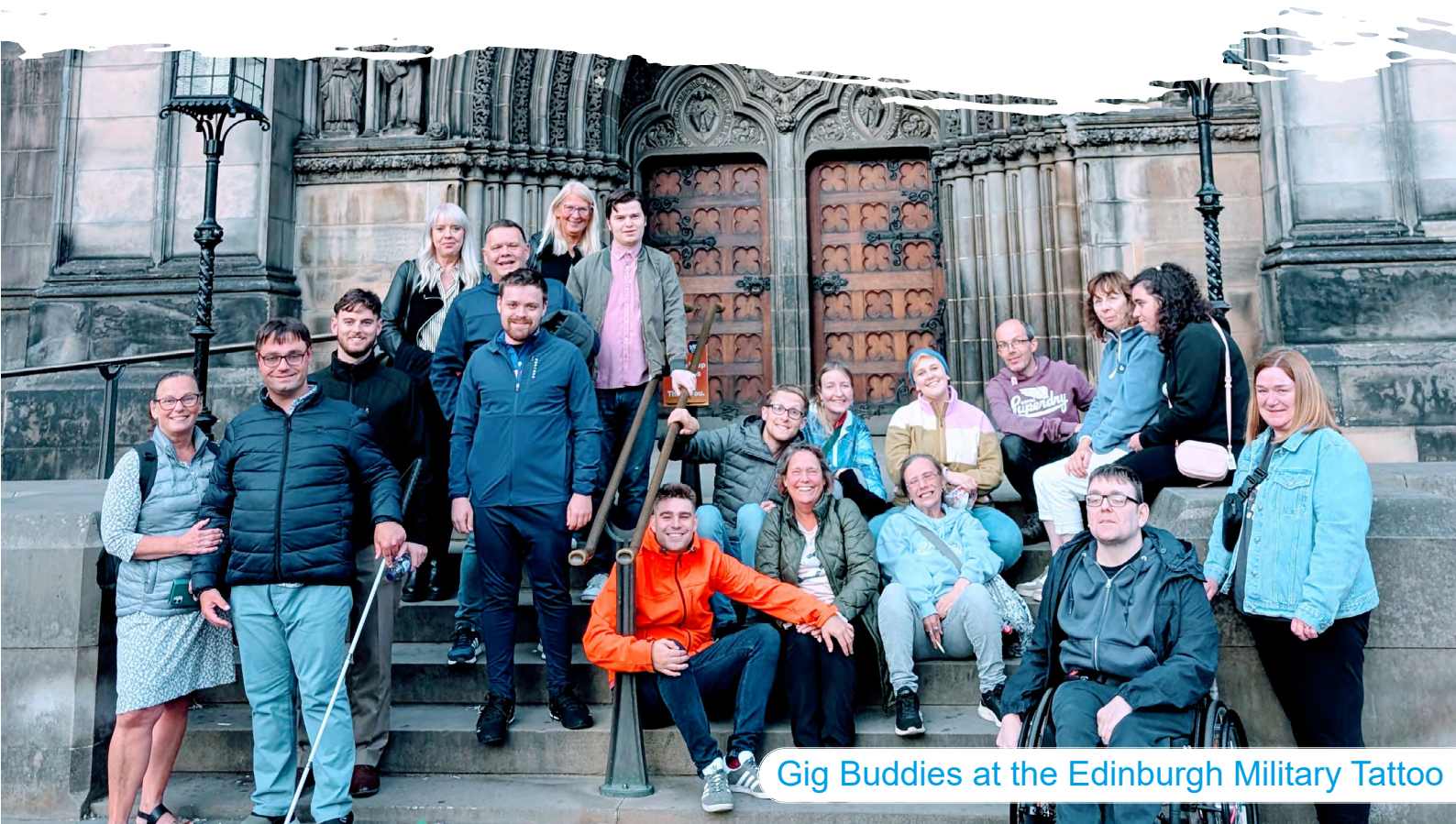
Gig Buddies at the Edinburgh Military Tattoo