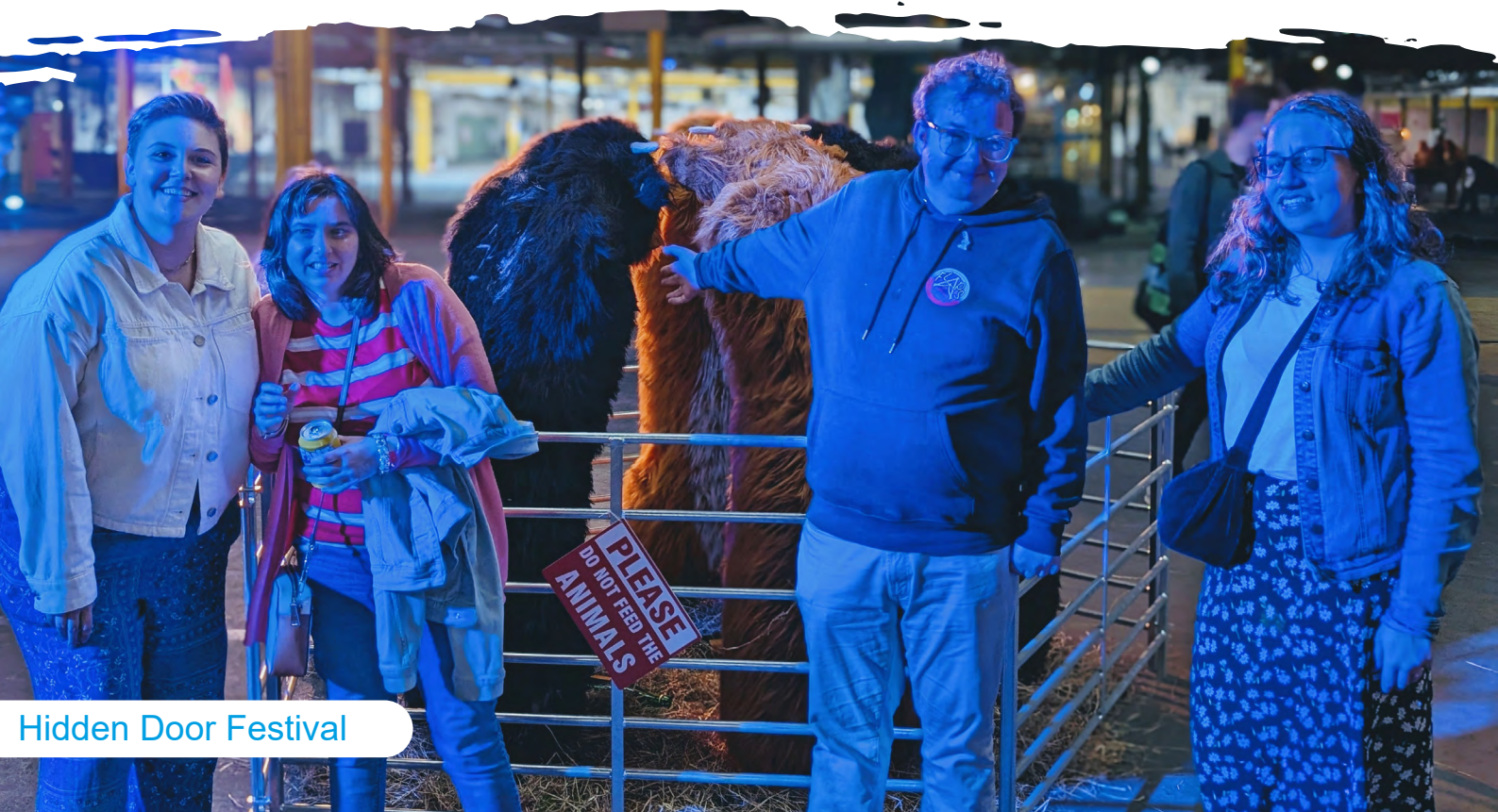
Hidden Door Festival