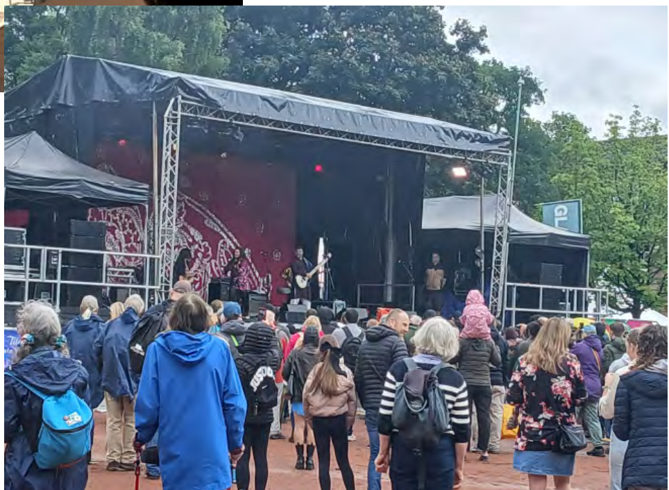
Reely Jiggered performing at Glasgow Mela