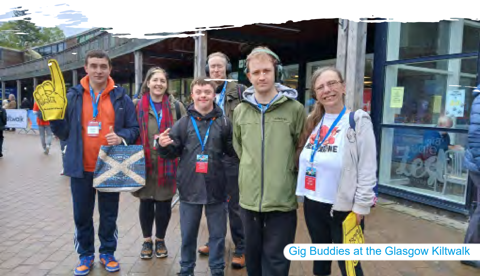
Gig Buddies at the Glasgow Kiltwalk