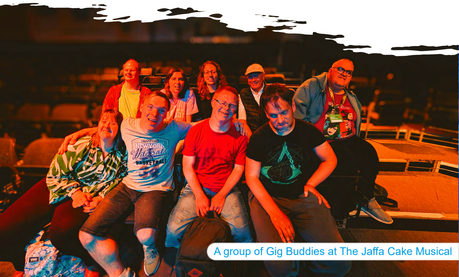
A group of Gig Buddies at The Jaffa Cake Musical