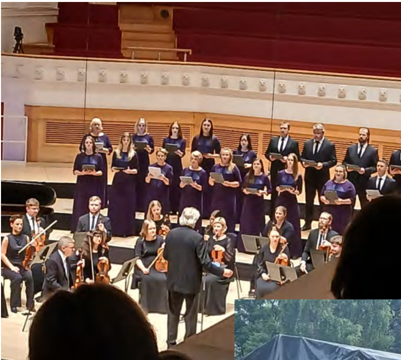
The Estonian Philharmonic Orchestra performing at City Halls

We even had a go at line dancing at Maggie May's- though the project coordinator may have danced right into a pillar on a few occasions!